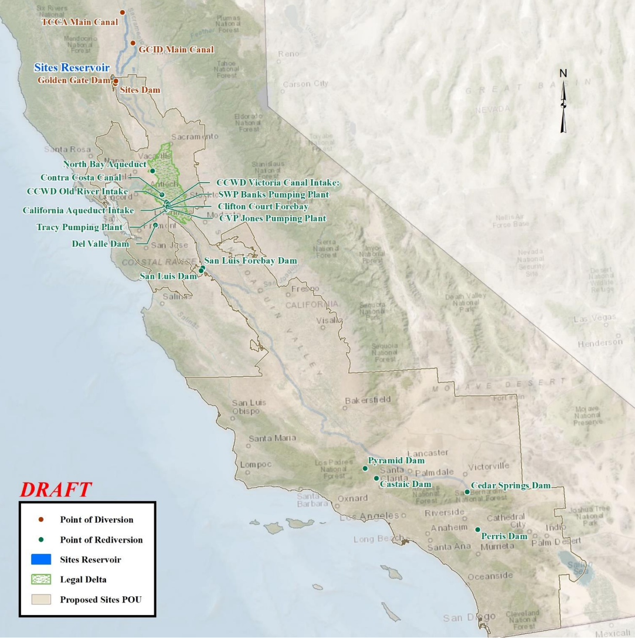
Figure 1. Place of Use Map