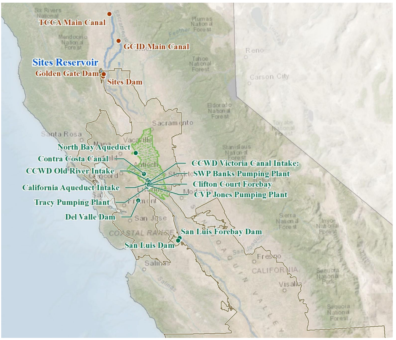
Figure 2. Place of Use Map, North of Delta and Delta Detail