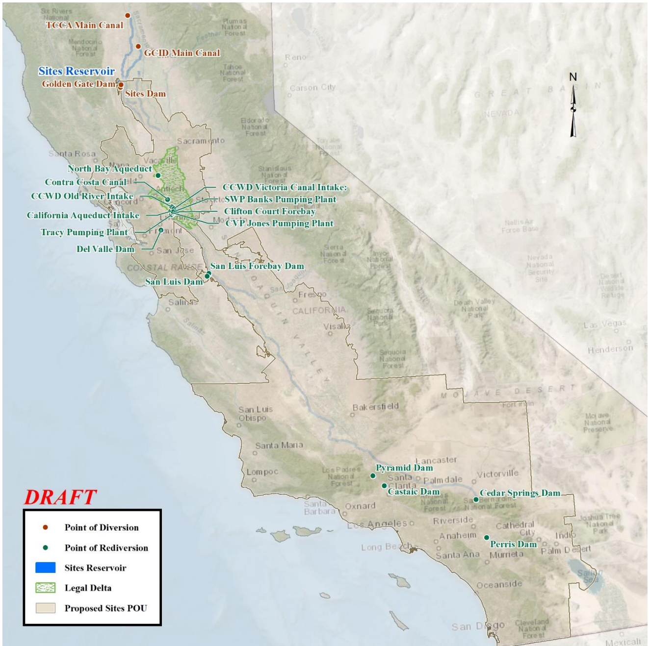
Figure 1. Place of Use Map