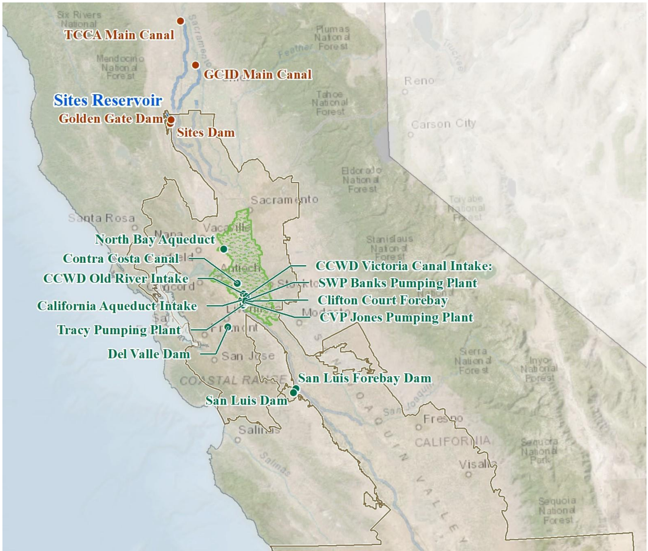
Figure 2. Place of Use Map, North of Delta and Delta Detail