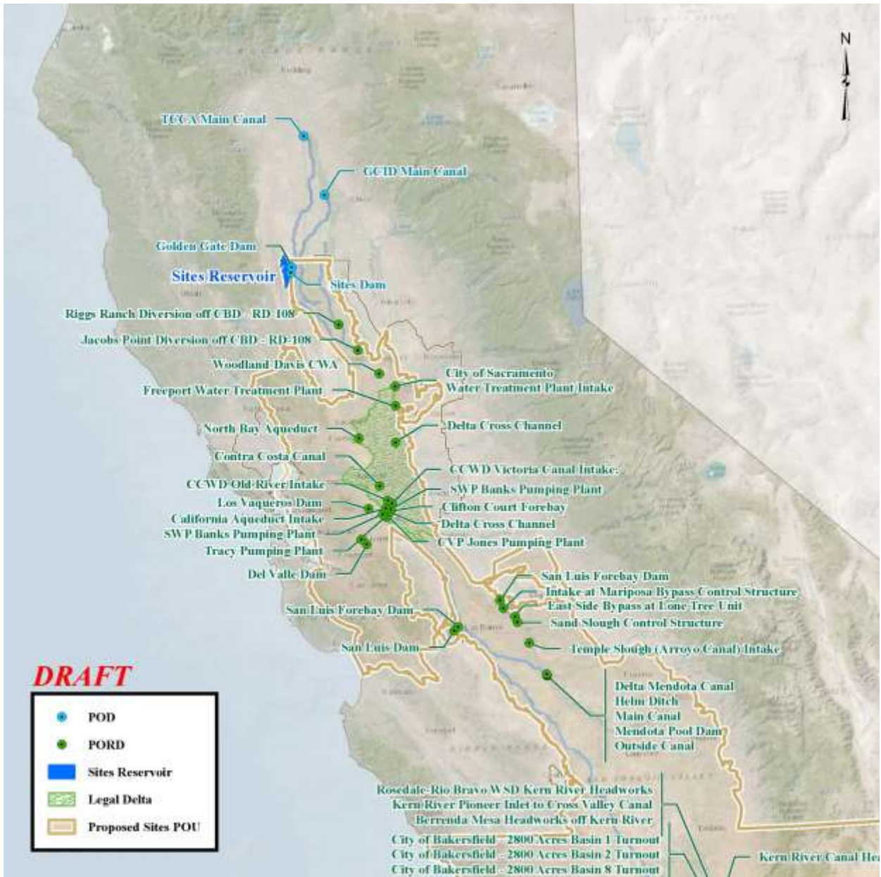
North of Delta and Delta Proposed Place of Use and Points of Diversion/Points of Rediversion