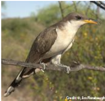
Figure 1. Yellow-billed cuckoo

Adult yellow-billed cuckoos have a fairly stout and slightly down-curved bill; a slender, elongated body with a long-tailed look; and a narrow yellow ring of colored, bare skin around the eye (see Figure 1). The plumage is loose and grayish-brown above and white below, with reddish primary flight feathers. The tail feathers are boldly patterned with black and white below. They are a medium-sized bird about 12 inches (in) (30 centimeters (cm)) in length, and about 2 ounces (oz) (60 grams (g)) in weight. The bill is blue-black with yellow on the basal half of the lower mandible. The legs are short and bluish-gray. Males and females differ slightly and are indistinguishable in the field (Hughes 1999, pp. 2–3).